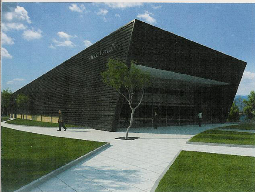
THE NEW JOAO CARVALHO HEADQUARTERS IN ALCANENA RENDERING DELLA NUOVA SEDE DI JOAO CARVALHO AD ALCANENA

In 2004 I started working on models through the technique of "skin on skin", in fact specially tanned and treated leather (the prime material I use for my sculptures) that adheres perfectly to the body and takes on its lines and forms, capturing unique moments that seem to be held in eternity. That is why I call my creatures Eternal Nudes. Also in my artistic works I adopt traditional methods derived from the ancient artisans, that I have learned and used over the years and integrate into new, inventive processes I have patented.