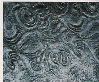
EXAMPLES OF SOME LEATHER FINISHES ALCUNI ESEMPI DI FINISSAGGI SUI PELLAMI